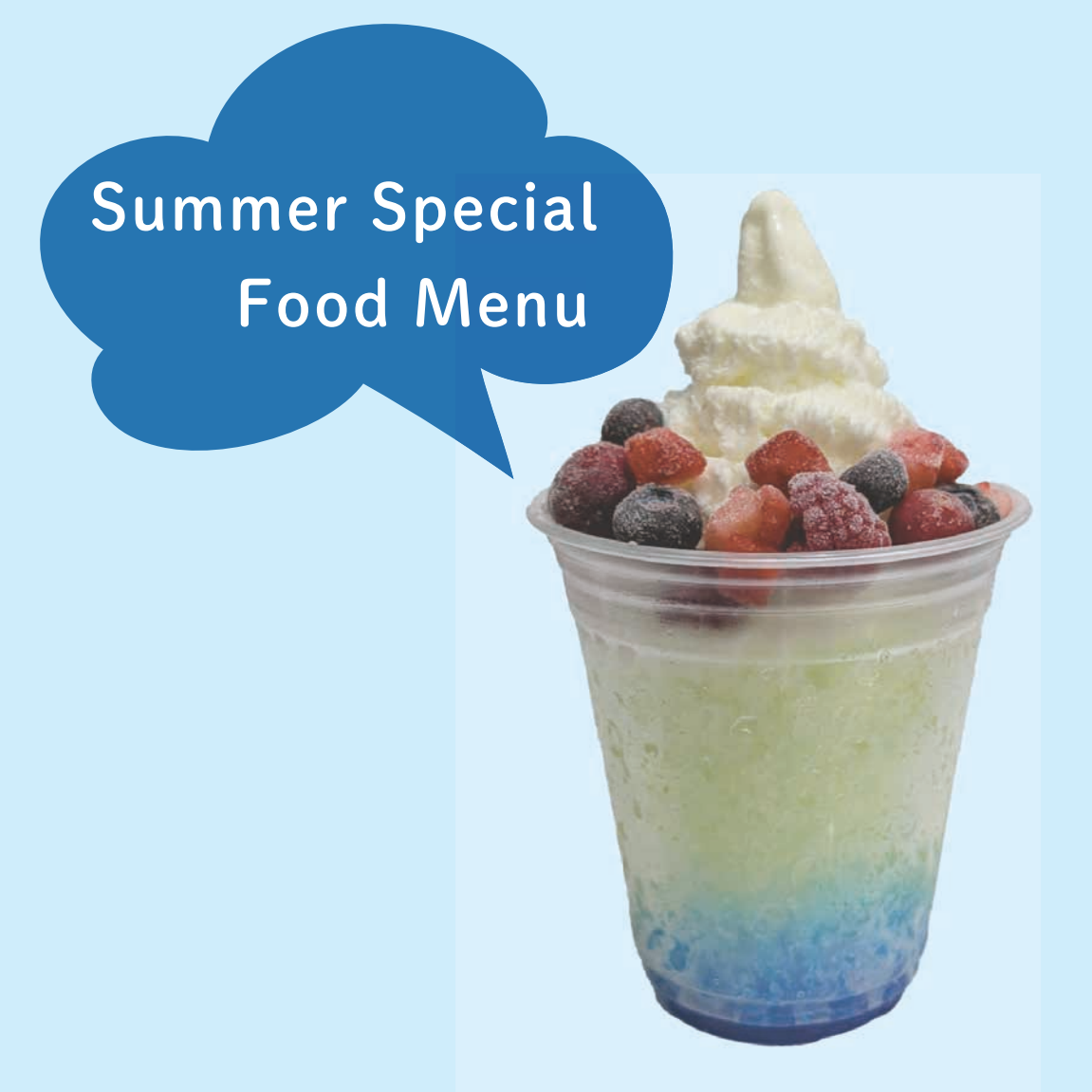
Seabreeze Berry Sundae 680 yen

Available at Komorebi Shop and Hanako Café. Sold during Early July to August. *Sales period may vary depending on availability.