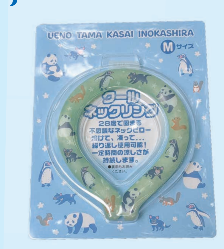
Cool Neck Ring: 1,500 yen

Available at Komorebi Shop *Available in limited quantities. Sales will end when sold out.